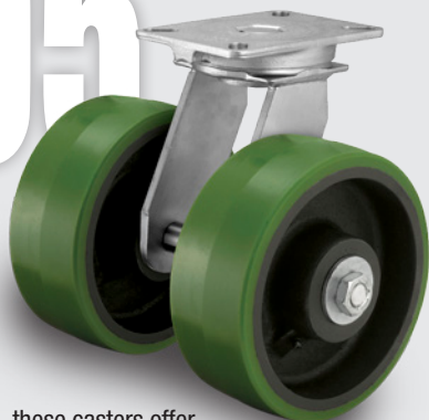
290 Polyurethane/ Iron

In most instances, these casters offer greater capacity, while maintaining the lowest possible overall height. Differential action helps to reduce scrubbing when changing directions. Because they are made from the single wheel caster rig, cantilever-style dual wheel casters can be field built.