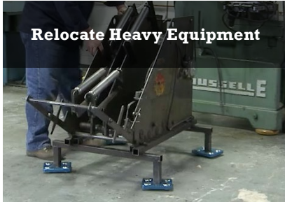
Relocate Heavy Equipment