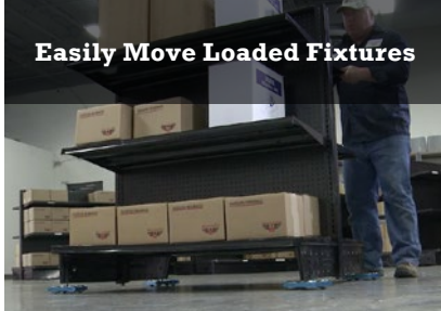
Easily Move Loaded Fixtures