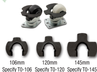
106mm Specify T0-106 120mm Specify T0-120 145mm Specify T0-145