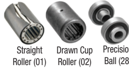
Straight Roller (01) Drawn Cup Roller (02) Precision Ball (28)