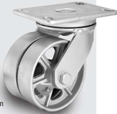
272 Cast Iron

Designed for greater capacity and better distribution of floor load with lowest possible overall height. These casters have differential action when changing direction, thus greatly reducing the scrubbing effect resulting from use of wide faced, small diameter wheels.