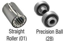
Straight Roller (01)