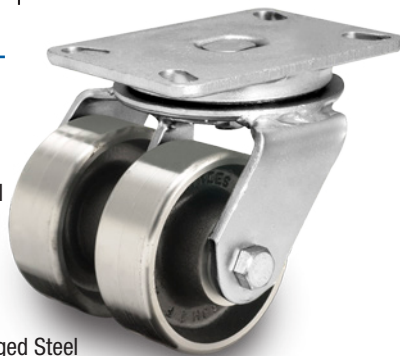
281 Drop Forged Steel

(Note 272 Series is a dual wheel 72 Series, 281 is dual wheel 81 series)