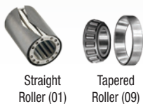
Straight Roller (01)