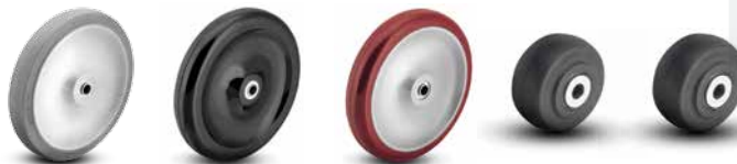
See the Performa Advantage on Page 67.

Performa Flat Tread Polyolefin Polyurethane HI-TECH Cushion Rubber Hard Rubber