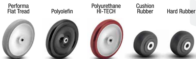
See the Perfoma Advantage on Page 67.