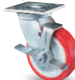
Tread Contact Brake [8" models only]