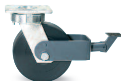
Heavy Duty Contact Brake [8" models only]