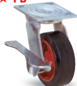
Side Foot Brake [8" to 12" models]