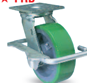
Rap-A-Round Foot Brake [8" to 12" models]