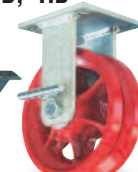
Thumbscrew Brake [8" to 12" models, -HB on 16" & 18"]