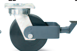
Heavy Duty Contact Brake [8" & 10" models]