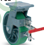
Foot Contact Brake [8" to 18" models]