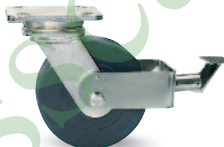
Stainless Steel Heavy Duty Contact Brake