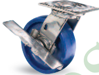
Stainless Steel Side Foot Brake