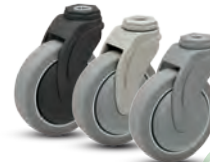
Custom Colors Available