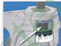
316S stainless steel precision sealed ball bearing raceway design for smooth, quiet maintenance free ride.

Nylon and 316S stainless steel construction allows these casters to have a reduced magnetism.