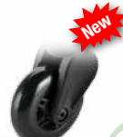
Donut Black Polyurethane