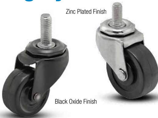
Zinc Plated Finish