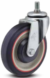
Standard Zinc plated